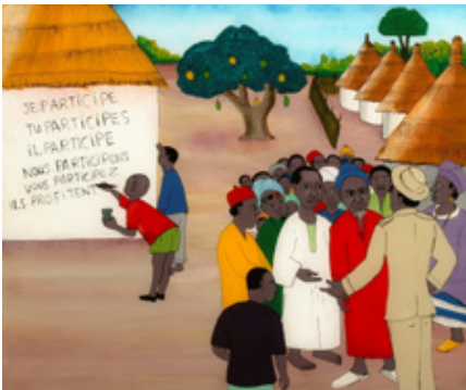
Composed by: Jesse Ribot. Painted by: Mor Gueye

Look here in the rulebook—which you must obey— you have rights to the things that we don't take away. But we can't take the wood without taking the trees so you'll have to make due with the stumps and some seeds.